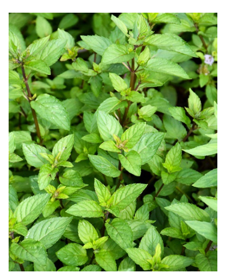
Mint, Chocolate (Perennials)

SKU: HER220 | Seedlings: $5.75 (1 Seedling per pot)