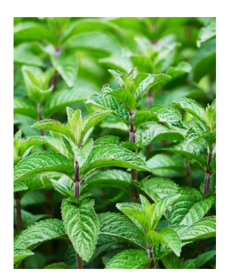
Mint, Peppermint (Perennials) CERTIFIED ORGANIC!

SKU: HER226 | Seedlings: $5.75 (1 Seedling per pot)