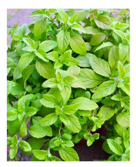
Mint, Banana (Perennials)

SKU: HER219 | Seedlings: $5.75 (1 Seedling per pot)