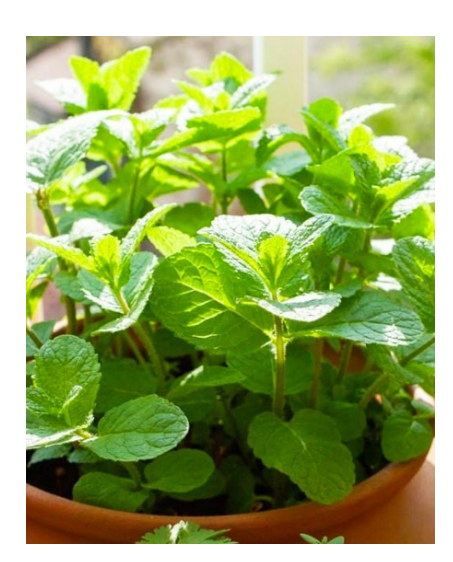
Mint, Spearmint (Perennials) CERTIFIED ORGANIC!

SKU: HER225 | Seedlings: $5.75 (1 Seedling per pot)