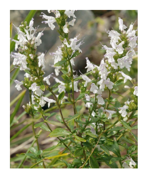
Mint, Balkan (Perennials) CERTIFIED ORGANIC!

SKU: HER219 | Seedlings: $5.75 (1 Seedling per pot)