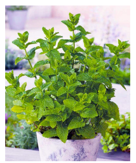
Mint, Moroccan (Perennials)

SKU: HER223 | Seedlings: $5.75 (1 Seedling per pot)