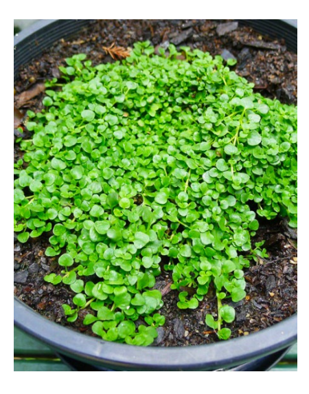
Mint, Corsican (Perennials)

SKU: HER222 | Seedlings: $5.75 (1 Seedling per pot)