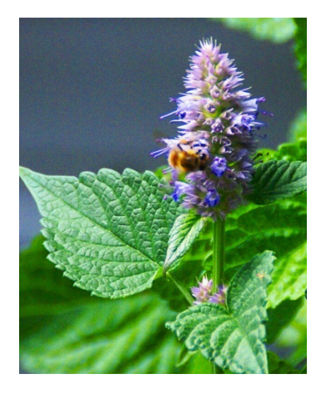
Mint, Korean (Perennials)

SKU: HER225 | Seedlings: $5.75 (1 Seedling per pot)